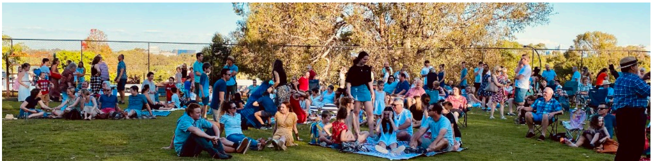
The Household of God