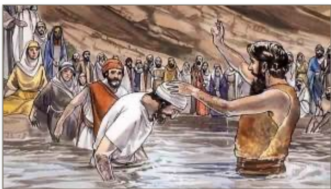
Jesus is the stronger one.