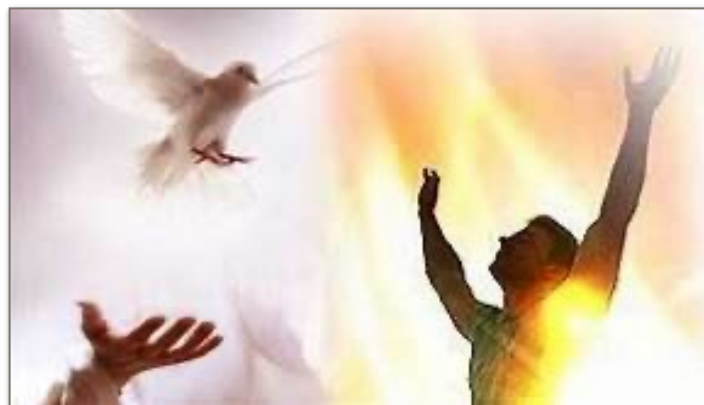
The Holy Spirit comes to empower us.