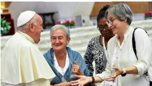
Pope Francis shares a laugh with some of the women members of the Assembly of the Synod of Bishops (Text and photo from therecord.com.au )

Divided into 35 small groups of 10 to 12 people ranging from cardinals to college students, the participants spent the third day of the synod assembly sharing what they had discussed in their small groups in the previous days and listening to individual remarks made to all synod members present. For more on the Synod and other news go to therecord.com.au