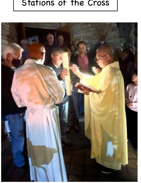
Easter Vigil of the Resurrection of the Lord