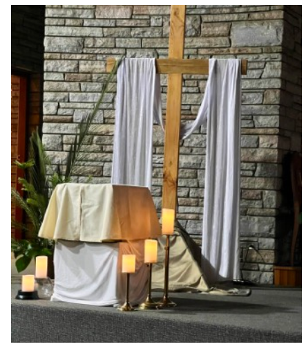
Thursday of the Lord's Supper