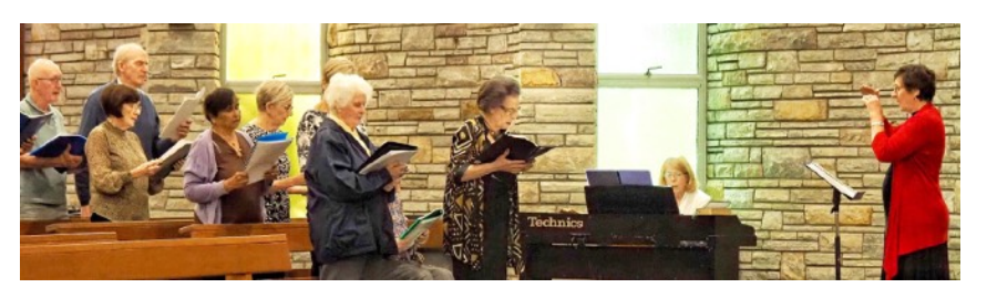
Friday of the Passion of the Lord